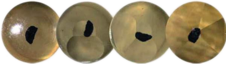
Steps to trimming a pyramid