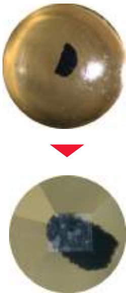
Build a pyramid in less than 60 seconds

With the EM TRIM2 a perfect pyramid and cutting face of both biological and industrial samples can be produced safely, rapidly and accurately within less than 60 seconds: