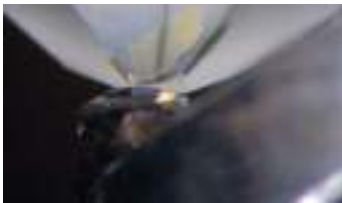
Diamond miller Si sample trimming

In addition to the unique features of the EM TRIM2 the EM RAPID offers further opportunities to perform high end sample trimming.