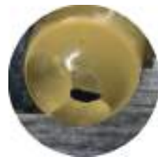
Milling positions between 0° and 60°