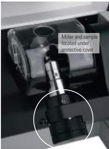
Locking mechanism of the specimen adjustment assembly. Miller and sample are located under a protective cover.

The locking mechanism of the specimen adjustment assembly provides a stable and rigid connection to the pivot arm. Four 90° click stops provide accurate and parallel positions for milling pyramid sides.