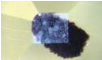
Lever sample trimmed (front face observation)