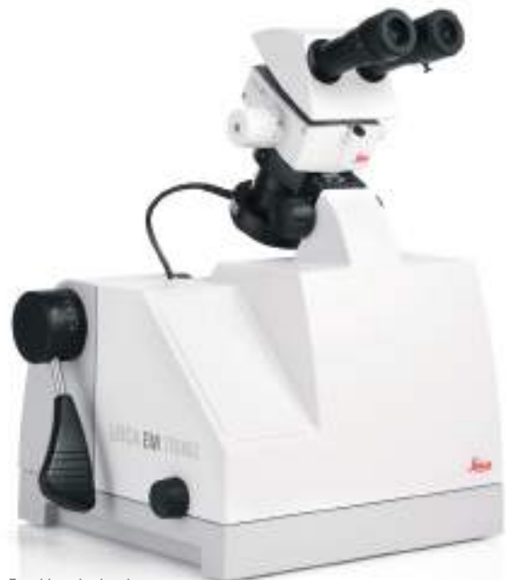
Feed hand wheel

The EM TRIM2 can be ergonomically configured with an M50 stereo microscope in conjunction with the ergo-wedge. The use of the M50 stereo also allows the use of additional equipment such as TV camera and distance definition equipment.