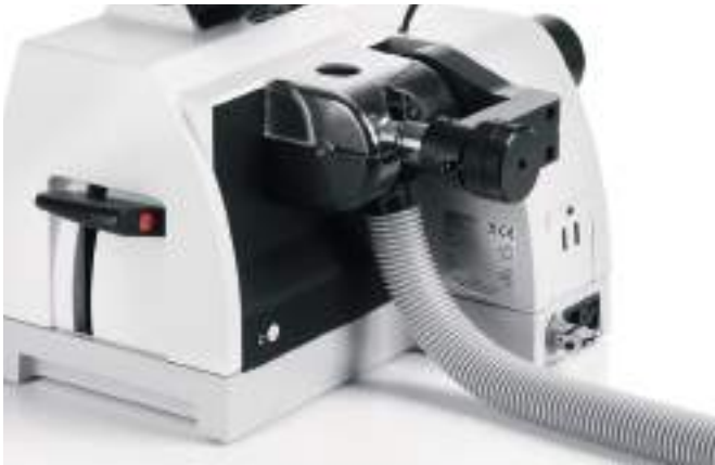
Waste connection to the extraction and filtration unit.