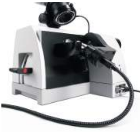
Fibre optic transillumination

For TEM and LM, the sample must then be trimmed to shape by adjusting the angle of the pivot arm and trimming the desired block shape – pyramidal, square rectangular, etc... Viewing of the specimen perpendicular to the axis of the stereomicroscope allows distance definition i.e. from the front face the sample. All this takes place under constant observation with the stereo microscope.