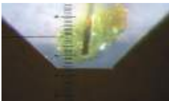
Embedded Si sample (perpendicular view)